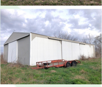
Offered in 2 parcels & in its entirety